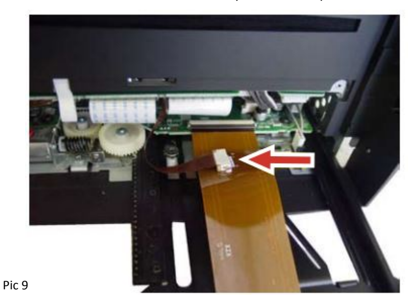
STEP 10: Carefully fold and insert the flex ribbon cable inside the navigation unit cavity.

STEP 9: Connect small flex ribbon cable to the main flex ribbon cable with the contacts facing UP. A half twist on the small flex ribbon cable is necessary for this step.