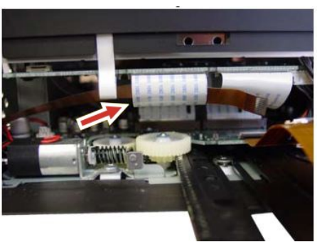
STEP 8: Route small flex ribbon cable inside the large white factory flex ribbon cable to avoid the mechanism gears.