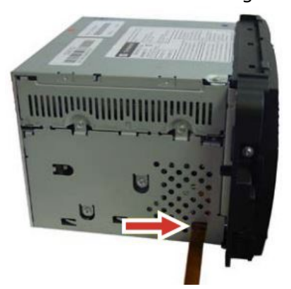
STEP 7: Route small flex ribbon cable through the side of the navigation unit with the contacts facing DOWN.