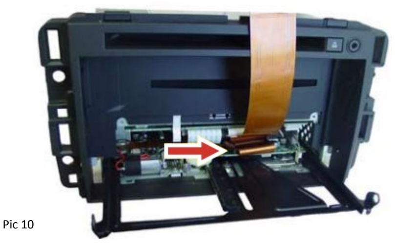
STEP 11: Assemble the navigation headunit in reverse order of steps, staring from step 6 down to step 1.