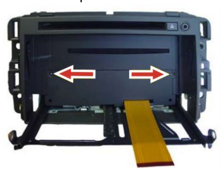
STEP 5: Remove two screws from the center cover and remove the center cover panel.