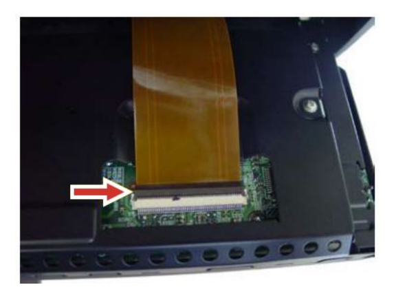
STEP 4: Carefully lift up the brown release tab and release the factory flex ribbon cable.